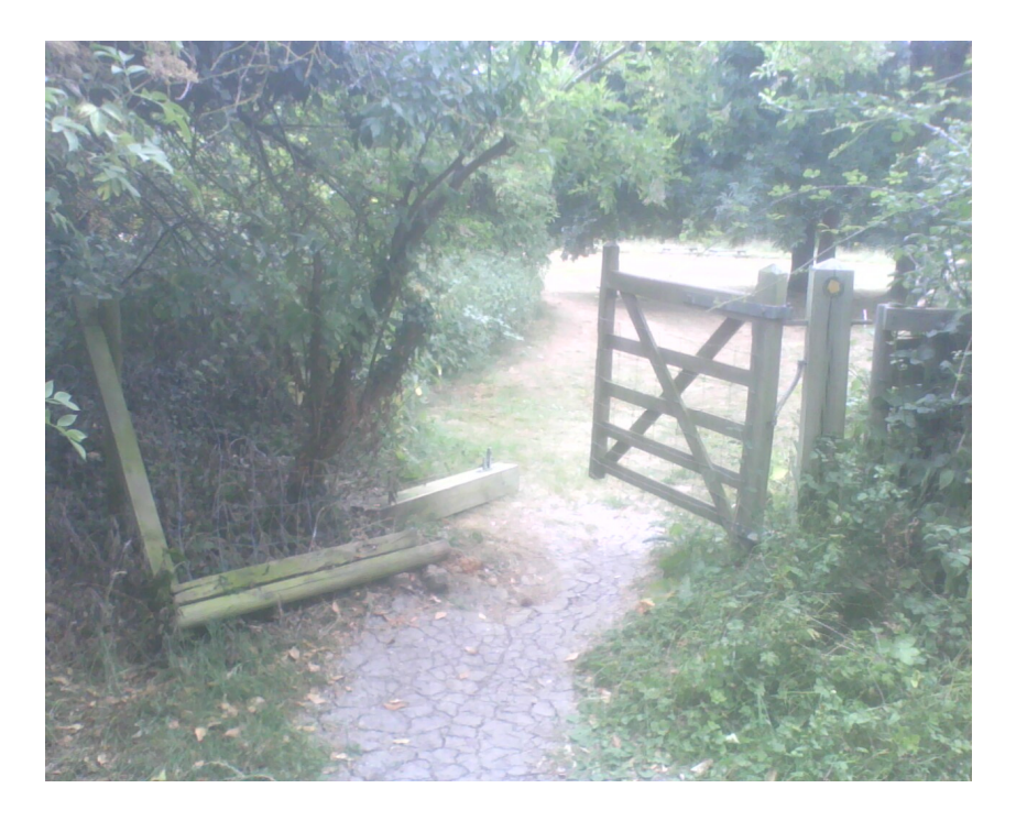
Gate post by path, fence and post laying down in dangerous position

Overhanging brambles and branches at head height